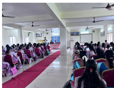
Seminars and Workshops